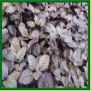
Purple waffle plant, red ivy, red flame ivy

This good old-fashioned plant is a hardy evergreen vine (or ground cover) found flourishing in cities around the world. It is also well regarded for removing VOCs from the air. English ivy is easy to grow and with its lush foliage it can look dramatic on a living wall. Do not be afraid to prune it back, as it can become a little invasive and aggressive. The vine enjoys a reasonably fertile soil with moderate watering and good drainage. It will handle a range of pH levels.