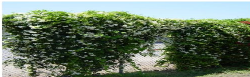
Figure 27: Stephanotis floribunda : This plant is widely known as the 'Wedding Vine'