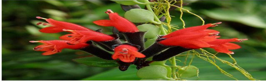
Figure 21: Aeschynanthus radicans : A Lip-stick plant