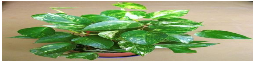
Figure 20: Epipremnum aureum or devil's ivy – an evergreen variegated weeping climber native to French Polynesia