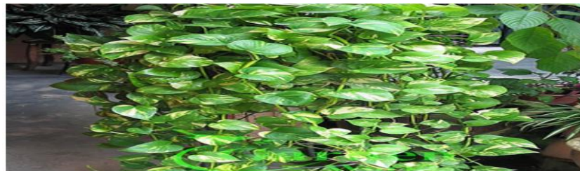
Figure 28: Epipremnum aureum - known as the 'Australian native monster'