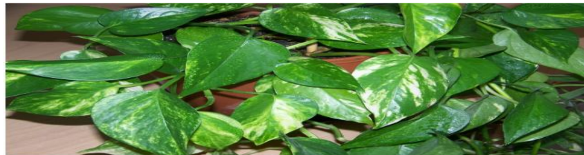
Figure 24: Epipremnum : plant is commonly known as 'Pothos'