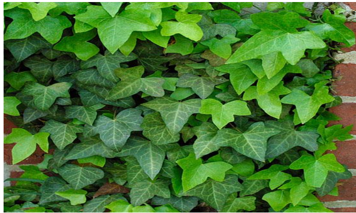
Figure 3: English Ivy grown as a hardy, evergreen vine

They have dense spreading strap-like leaves that are glossy and dark green. Though it is grown for its dense green foliage, it does bloom in summer and its flowers are quite showy.