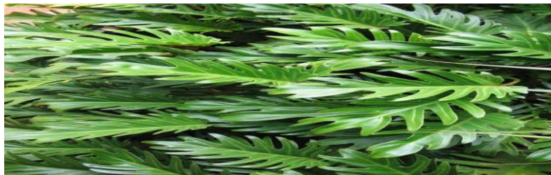
Figure 16: Philodendron 'Xanadu' – An evergreen shrub with attractive tropical-looking leaves from Brazil