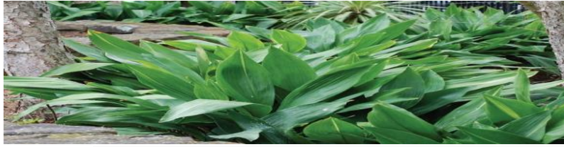
Figure 18: Aspidistra elatior or cast iron plant – an evergreen plant with long, wide leaves that is native to Japan and Taiwan