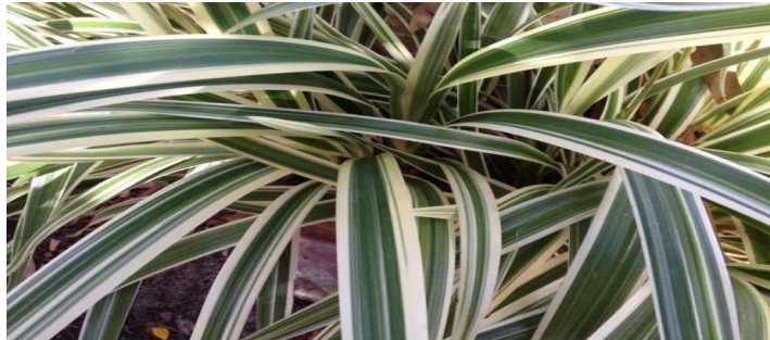
Figure 12: Opiopogon japonicus or mondo grass – A fine dark-leaved grassy plant from Asia