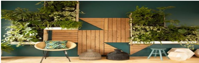
Figure 15: Indoor Vertical Gardening Model