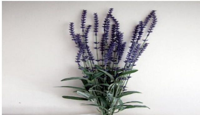
Figure 8: English Lavender: an Evergreen Garden herb