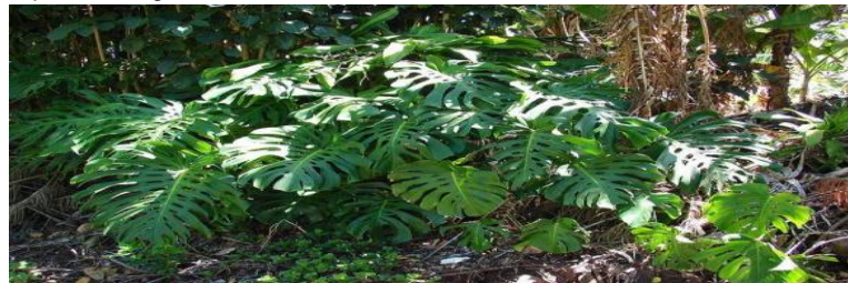
Figure 17: Monstera deliciosa or Swiss cheese plant – an evergreen shrubby climber with oversized and very attractive tropical leaves, native to Mexico

Monstera deliciosa or Swiss cheese plant – an evergreen shrubby climber with oversized and very attractive tropical leaves, native to Mexico