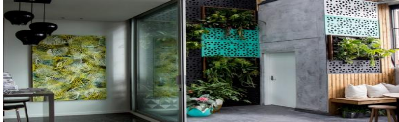
Figure 21: The Block TV Garden. Design Phillip Withers Landscape Design