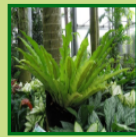
Bird's nest fern

The quintessential fern, the Boston variety is the more commonly known, is easy to grow and typically found in containers and hanging baskets. Like most ferns it grows best in full to partial shade, but will withstand partial sun. Hailing from tropical climates of the Americas it prefers warmth and humidity, and will require being indoors in winter in temperate climates. It will thrive when well watered and in rich soils. It prefers a neutral to acidic soil and will grow slowly and steadily. It may outgrow vertical garden containers in which case simply split up the rhizome (roots) and replant.