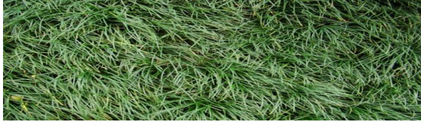
Figure 13: Chlorophytum comosum or spider plant – An evergreen strappy leaf plant native to Africa.