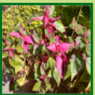
Party time, Mai Tai, Cognac, Crème de Menthe

A full to partial sun lover, silver falls fills gardens swiftly with its pretty heart-shaped leaves. It is a trailing plant that looks fantastic in a wall garden and is a perennial evergreen in warm climates. In cooler climates it is frost-sensitive and will grow as an annual: if planted as part of a larger evergreen wall garden its best to be in a suitable climate. Silver falls is comfortable in alkaline, neutral or acidic soils. Though it likes to be watered moderately, it is recognized as a heat and drought resistant plant.