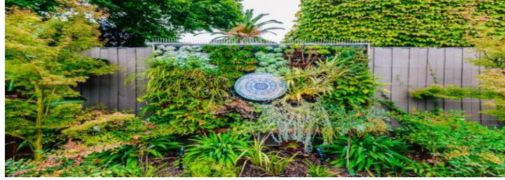
Figure 10: Vertical garden in Malvern East, Melbourne. Design Phillip Withers Landscape Design