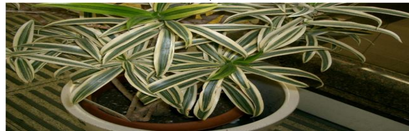
Figure 25: Dracaena -Designed as a pot plant