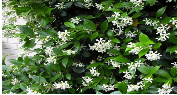
Figure 7: Star jasmine an Evergreen plant and can be easily trained on trellis