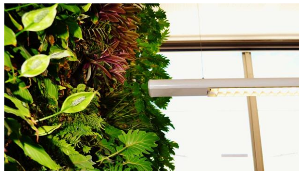
Figure 6: Peace lily is used in a vertical garden

Botanical name: Stephanotis floribunda Light and temperature: 70-90 degrees F Soil: high content of loam and peat moss. Water: water until the soil mixture is drenched; the mixture should drain freely Height: grows up to 6 feet or more