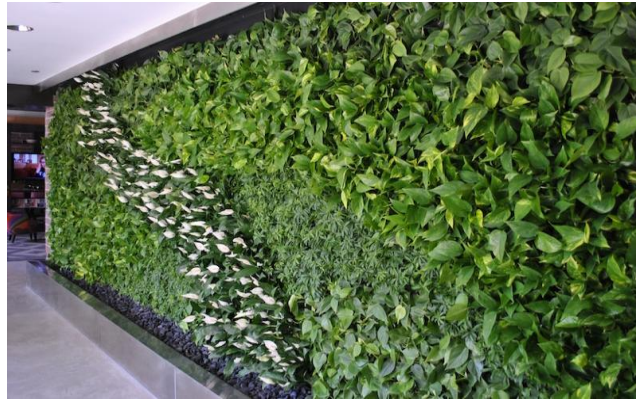
Figure 4: Philodendron grown both as an indoor and outdoor ornamental