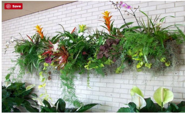
Figure 1: Green wall designing with Ferns, Flowers and Ornamentals

Adopted from vertical-garden-plant-species-guide ( https://wallgarden.com.au/vertical-garden-plant-species-guide ) the following boxes represent some of the prominent plant species (with special botanical characteristics) that can be suggested to be used in Vertical Gardens under varying designing and construction conditions: