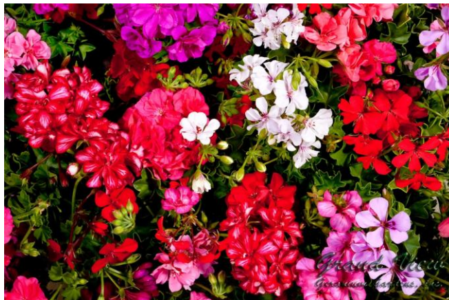
Figure 5: Geranium in red, pink and purple colours