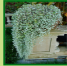
Dichondra, silver falls

Another excellent VOC remover, the purple waffle plant is an elegantly trailing evergreen perennial in warm to tropical climates. Its purple and silver foliage makes a nice accent plant on a wall garden; it is also used as a fast growing ground cover. Tiny white flowers bloom in spring and summer. The purple waffle plant loves warm, fertile and wet, but well-drained, conditions. It can handle a range of pH levels.