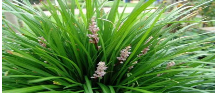
Figure 11: Liriope muscari or liriopelily turf – a solid and luscious fine leaf grass-like plant from Asia