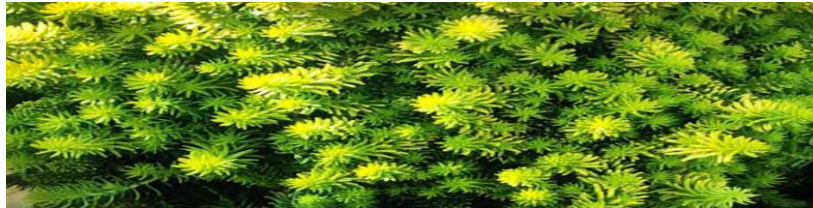
Figure 19: Sedum 'Gold Mound' – golden sedum – an evergreen soft yellow-foliaged succulent