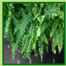
Boston fern, sword fern

http://www.ijat-aatsea.com/pdf/v13_n1_%202017_January/11_IJAT_13(1)_2017_Phonpho%20Sarayut_%20Plant%20Science.pdf