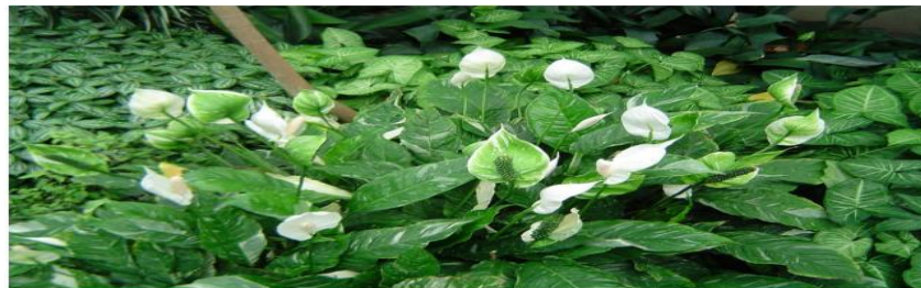
Figure 29: Spathiphyllum wallisii - most common home plants and are known as 'peace lilies'