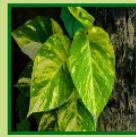
Pothos, golden pothos, devil's ivy

The rabbit's foot fern takes its name from the fuzzy exposed feet (rhizomes, roots or creeping stems) that stick out from its base. These rhizomes can be broken off and planted to establish new plants. Native to tropical Polynesia, this fern requires similar growing conditions to the above ferns (warmth, bright shade), but may not require quite as much watering.