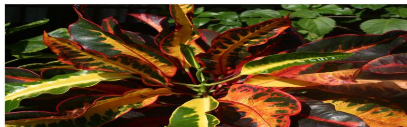
Figure 30: Codiaeum variegatum pictum - Also known as a 'Croton'

up the spaces in the wall, giving it a fuller look. So, even after your whole wall is complete, and you still need a finishing touch, this is the best choice. Such plants are easily available for the plant lovers or fans. It may be due to occurrence of best conditions. This kind of plant is available in the world with ease.