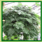
Rabbit's foot fern

This is another fern that lives successfully in containers, requiring the same conditions as the Boston fern. Bird's nest ferns have broader and more fragile leaves, which may damage easily, so it is best to leave them with a bit of room to grow. The yellow-green leaves offer bright contrast against darker greens in a wall composition. Asplenium Floralee is a cold resistant version option that needs perhaps a bit more humidity. It has more detailed, delicate fronds. And let's not forget the famous hen and chicken fern ( Asplenium bulbiferum ), well known for its hardiness in cool and even drier climates (it is still shade loving, though).