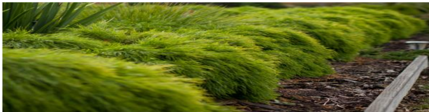
Figure 23: Acacia Cognata - also called the 'limelight bower wattle'