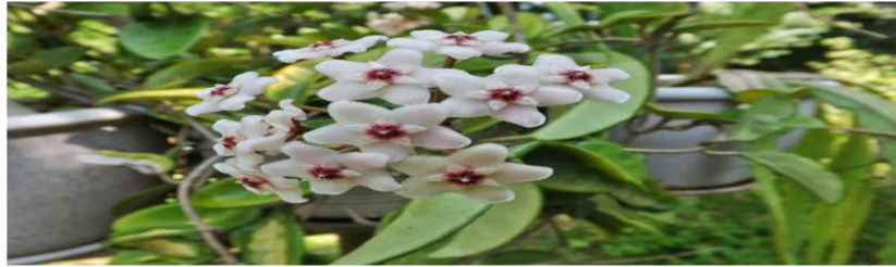
Figure 26: Hoya Carnosa : Popularly known as the 'wax flower'