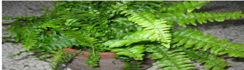
Figure 22: Nephrolepis exaltata -Also known as a 'Sword Fern'