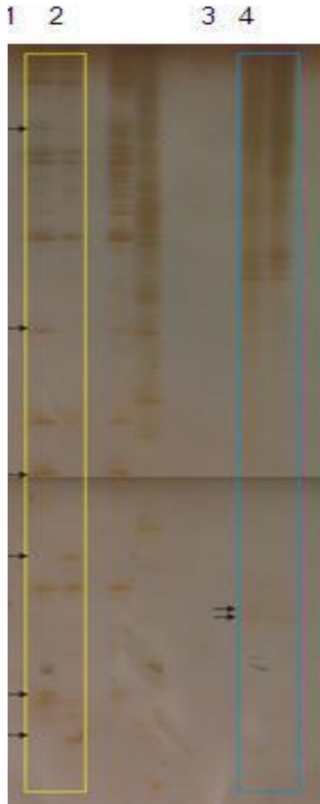
Figure 2. Separation of fragments by the technique of cDNA-AFLP in polyacrylamide gel 6%. Groove: 1 - SCSBRS Tio Taka at 25°C, 2 - SCSBRS Tio Taka at 13°C, E-ACG/M-CTA primers. Groove: 3 - SCSBRS Tio Taka at 25°C, 4 - SCSBRS Tio Taka at 13°C, E-AGC/M-CTG primers.

germination at 13°C, as shown in Figure 1, no polymorphic band was expressed in SCSBRS Tio Taka, a sensitive cultivar, when exposed to cold stress to germinate in combination of primers E-ACC/M-CAT, unlike the BRS Firmeza, a resistant cultivar, which when exposed to this stress, it expressed four bands in E-AAG/M-CTT combination. Using a combination of primers E-ACG/M-CTA, in germination at 25°C, it identified five polymorphic fragments in SCSBRS Tio Taka and one polymorphic fragment at 13°C. However, in the