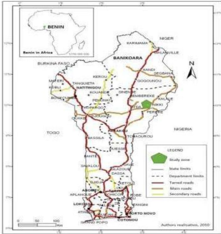
Municipality of Nikki