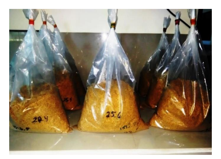
Figure 2. Fermentation process

As pre-experimental study through preparation of fermented feedstuffs, two hundred and fifty ml of red sugar was added into 2500 ml water. Effective microorganisms (EM4) solution which was procured from a local supplier was diluted with red sugar solution in three levels (20, 25 and 30 ml) and then stirred until homogenous. The resultant solution was mixed in 5 kg road paddy milling rice bran (RPMRB). The mixture was then put into a plastic bag and was firmly tied (anaerobic fermentation) for 2, 4 and 8 days of incubation. This method adopted Tellew et al (2013) with a slight modification (Figure 2).