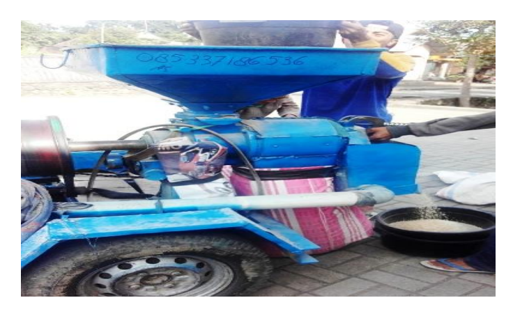
Figure 1. Road paddy miller

Rice bran was procured from the road paddy miller (Figure 1).