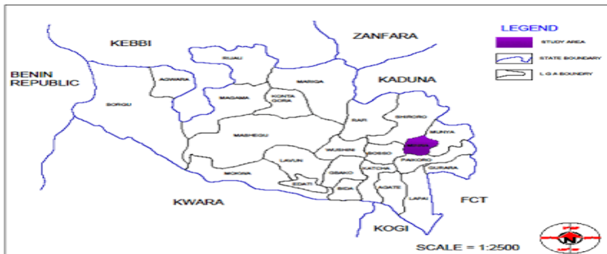
Figure 1: Map of Niger State showing study area in purple

The study was carried out in Makolo farm, Chanchaga Minna Niger State, Nigeria. Chanchaga is situated at 9°34 North latitude, 6°33 East longitude, with an area of 72km 2 (Figure. 1) and a population of 201,429 at the 2006 census. It has a moderate climate with a very high temperature during the dry season and average rainfall during the rainy season.