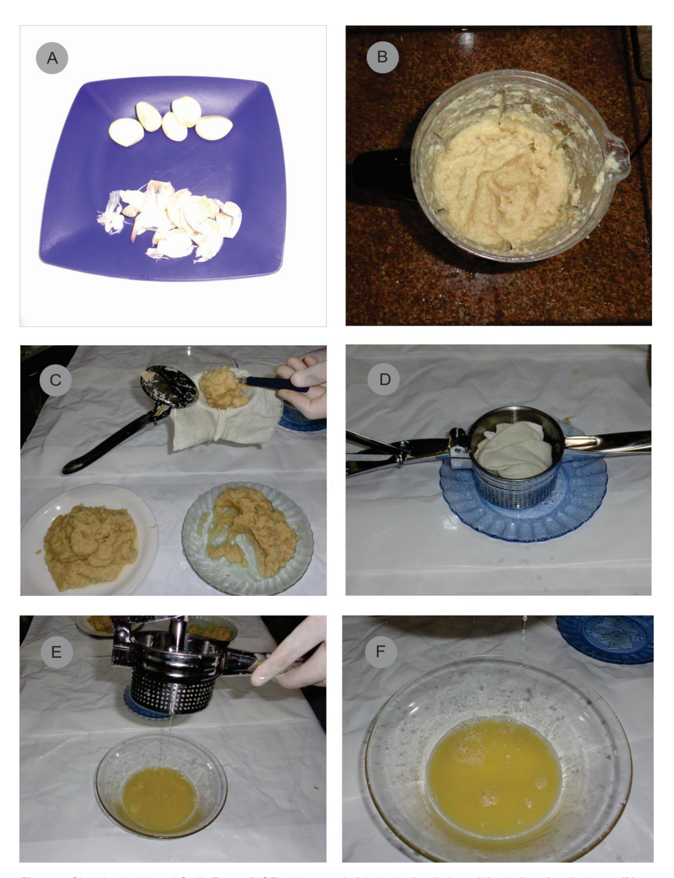
Figure 1. Obtaining the Natural Garlic Extract (NGE) with removal of the bark of garlic loves (A); grinding of garlic cloves; (B); pressing and filtering of the dough (C and D) and extraction of NGE (E and F).