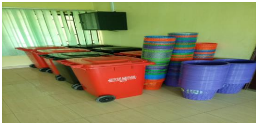
Image 1.0: Resource materials (wheelie bins, waste baskets and bin bags)

Total biogas obtainable = Amount of food waste (t) × VS (%) × Biogas yield (m 3 /t VS)