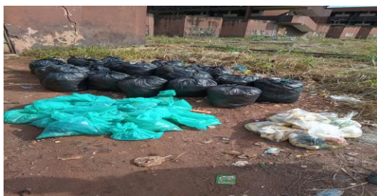
Image 2.0: Sorted Waste and Characterization of MSW by the research team