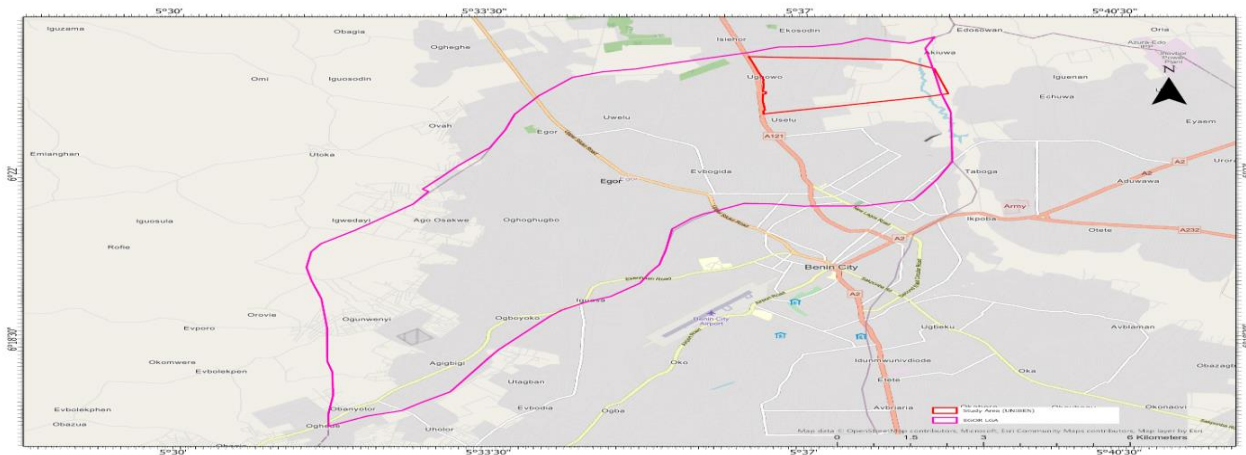
Figure 1.0: Map of Egor Local Government Area, Edo State (Google Map, 2020)

The University is located in Egor Local Government area of Edo state with major activities focusing on teaching, research and community services. In carrying out these functions, academic, administrative, residential and commercial spaces are provided.