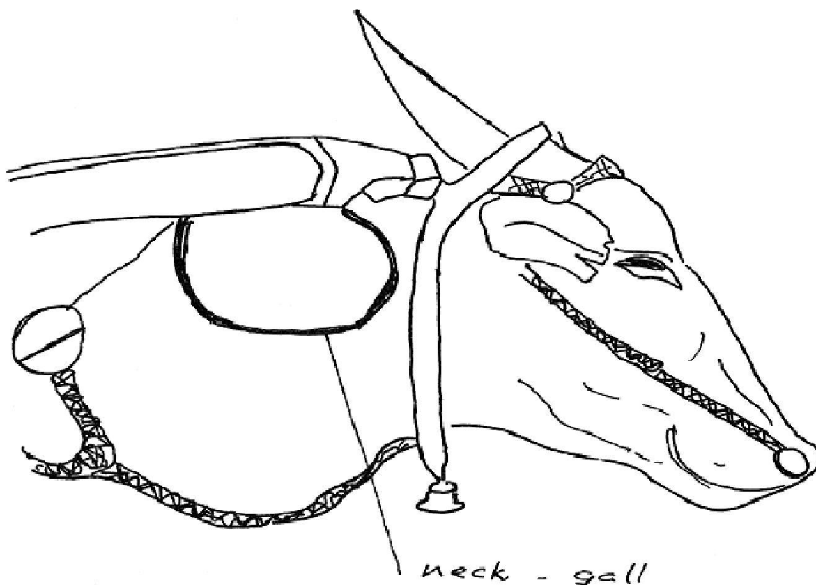
Figure 1. Neck-gall due to yoke rub (Ramaswamy, 1998).

distances to and from dipping areas and during these journeys animals are given water and allowed to rest. Non-dipping of cattle due to these limitations results in high tick loads that cause tick damages to parts, such as udders and scrotums and tick-borne diseases such as heart water and red water (Muchenje et al., 2008a). In such cases, it is advisable to use indigenous cattle breeds that are tolerant to ticks and less susceptible to tick-borne diseases.