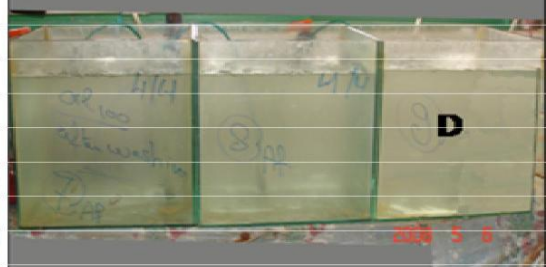
Figure 1. Photographs shows experimental frame work and the used glass aquaria filled with untreated seawater (control) (A); the P. aeruginosa in contact with M. cephalus fries - blank (B); the oily contaminated seawater under treatments (C) and; the glass aquaria of the washing process (D). The feeding regime.