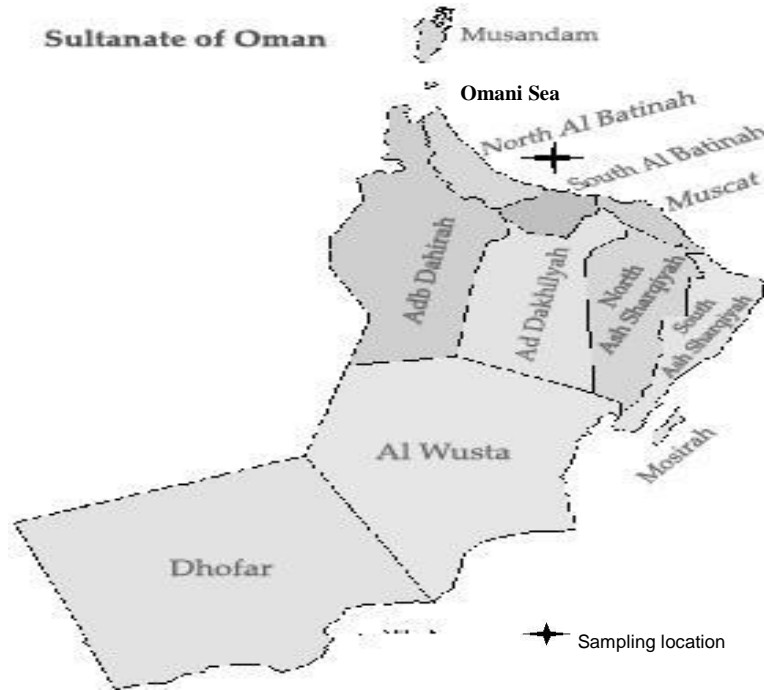
Figure 1. Study site.